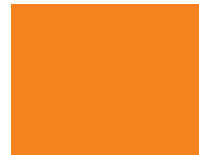
2 - naranja II