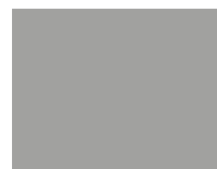
14 - negro PR-PO